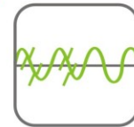
RFI / Noise